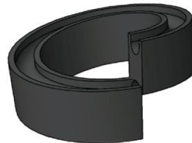
UNINSTALLED COIL SUMOSPRING